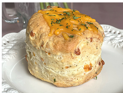
Cheddar, Garlic & Herb