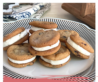
Chocolate Chip Cookie Sandwich