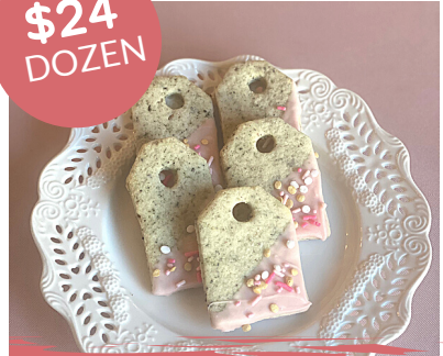
Jane's Signature Shortbread Cookie