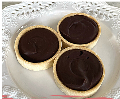
Chocolate Caramel Tart