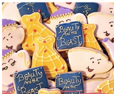
Beauty & Beast