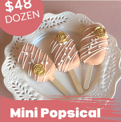
Mini Popsical Cake Pop