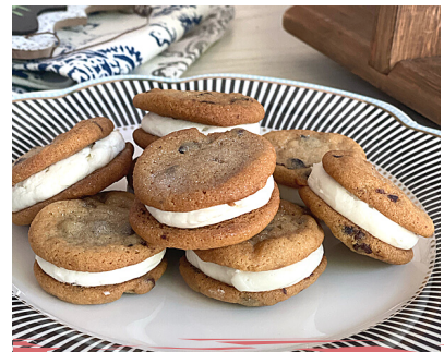
Chocolate Chip Cookie Sandwich