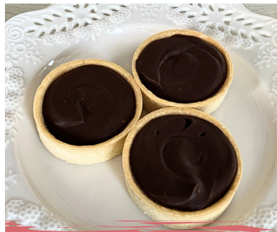
Chocolate Caramel Tart