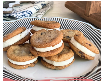
Chocolate Chip Cookie Sandwich