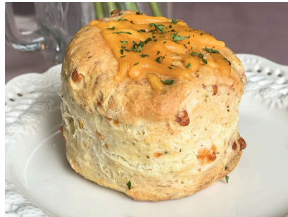
Cheddar, Garlic & Herb