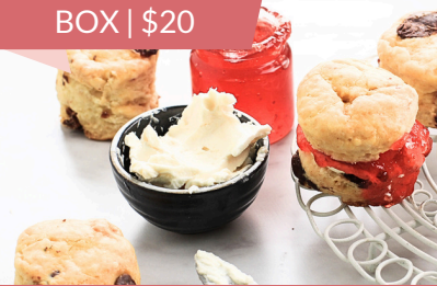
8 ASSORTED MINI SCONES TO TRY